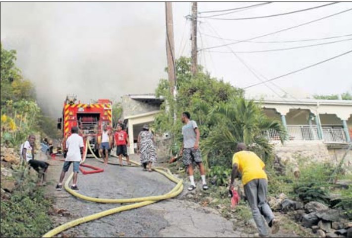
A fire truck is seen at the top of the hill in St. James. Smoke is coming from a smaller wooden house (not in view) behind the house in the photo.

Students and professionals interested in these events may follow the USC Facebook page at www.facebook.com/UnifiedSXM for more information and registration details.